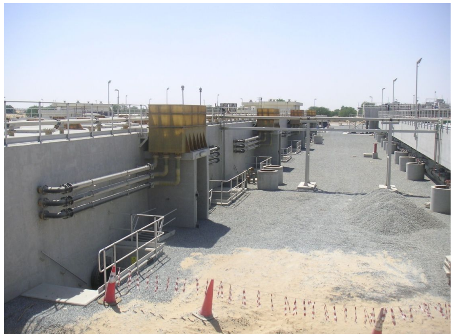
Side View of UASB Reactors at Ajman STP