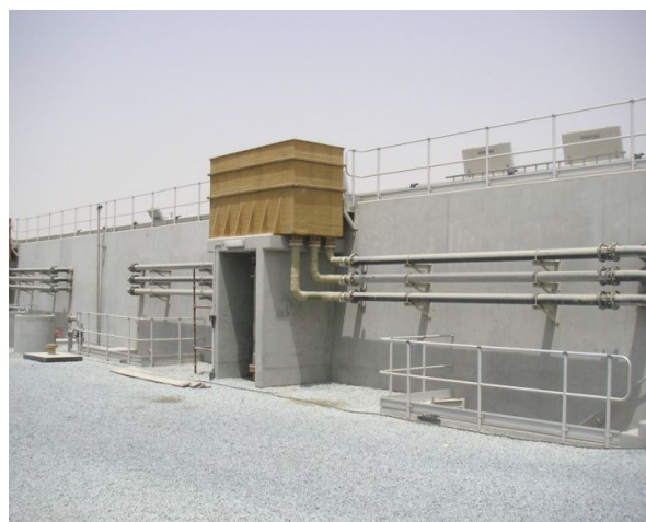
Distribution Box of UASB Reactor