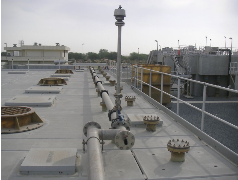
Top of UASB Reactor at Ajman STP