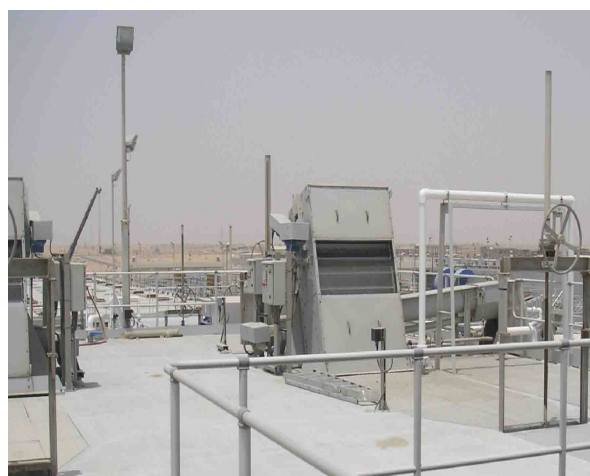
Pre Treatment before UASB Reactor